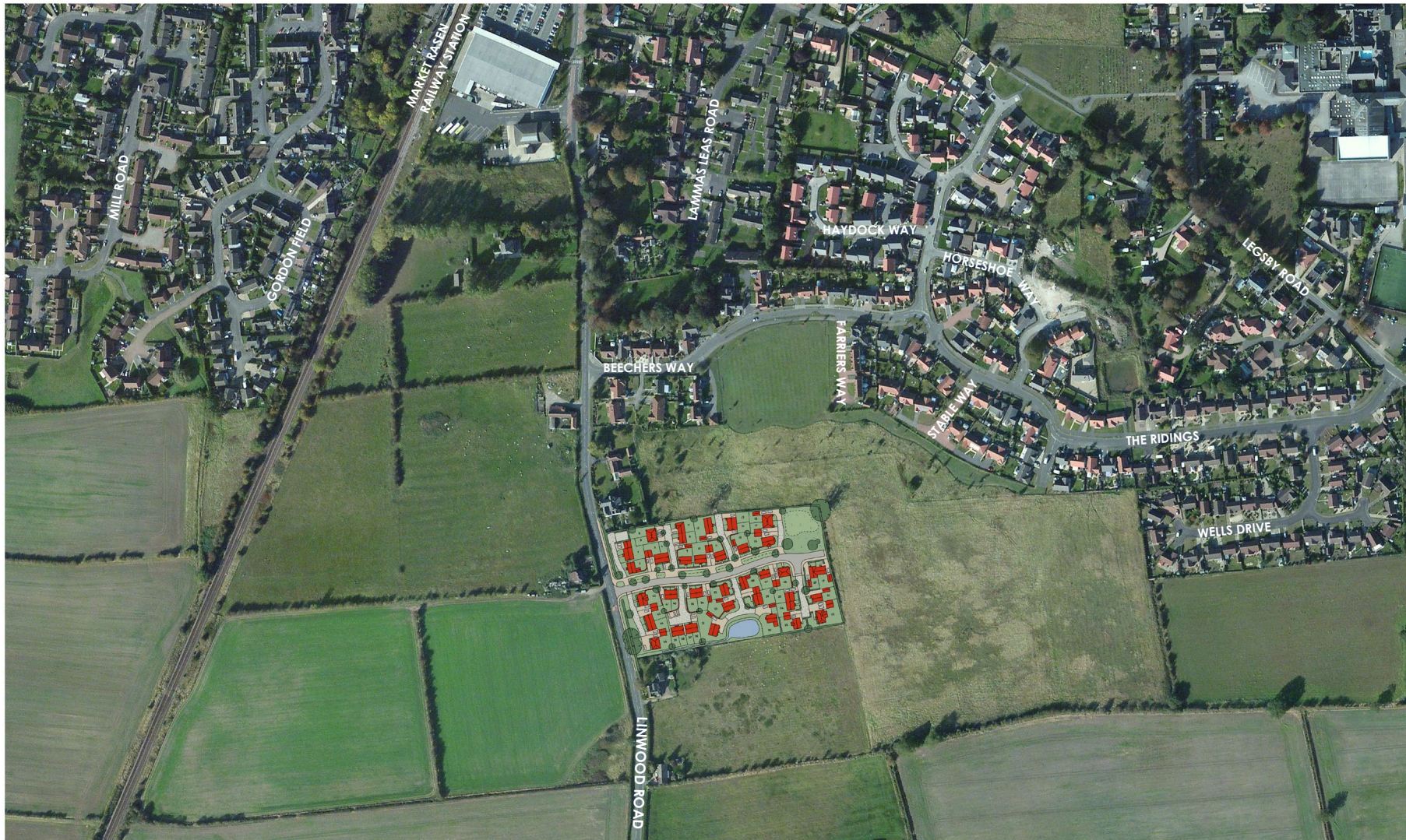
ILLUSTRATIVE SITE LAYOUT IN CONTEXT

This plan relates to the previous Outline Planning Permission from June 2018.