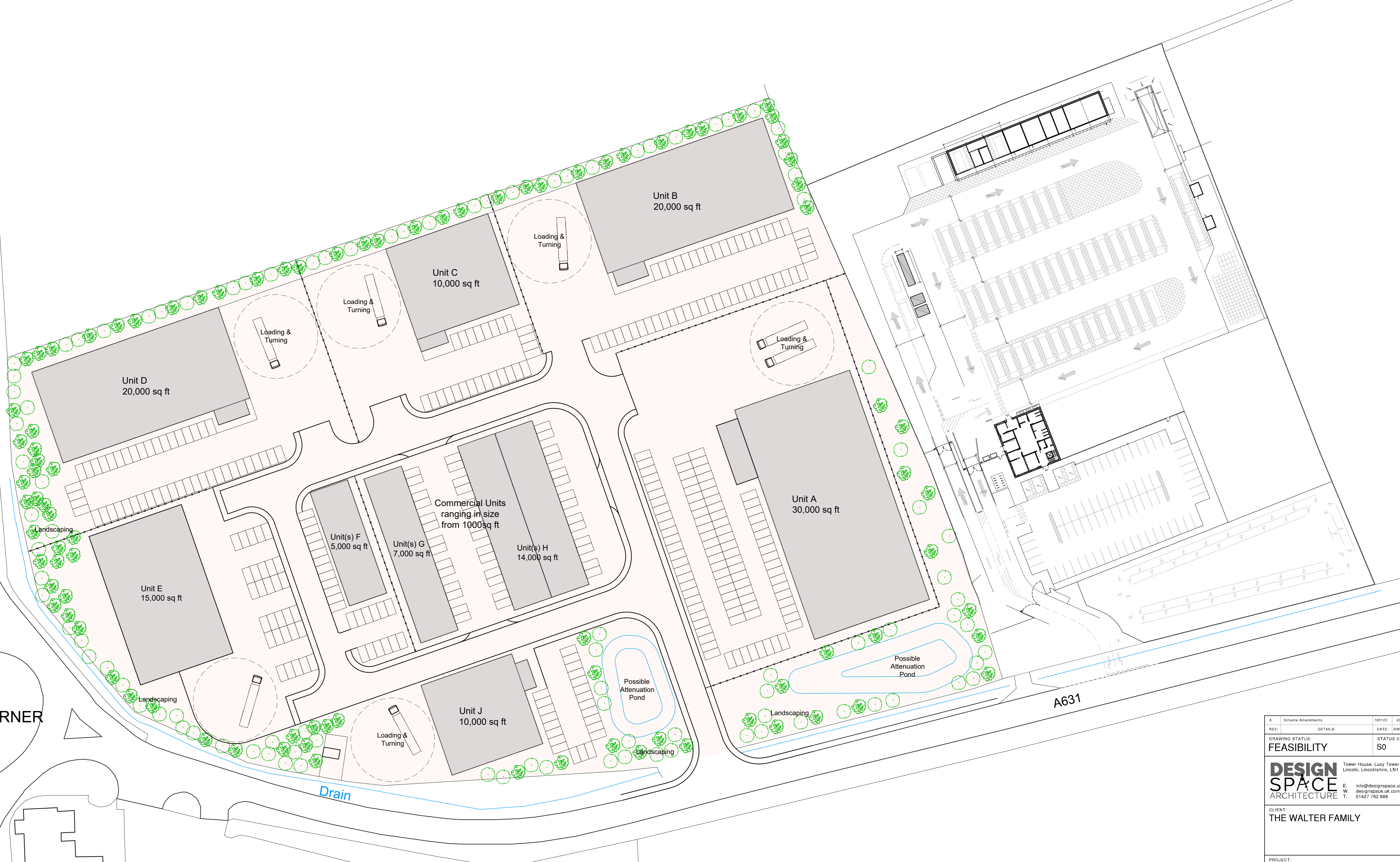
Sketch Proposals (1:500)